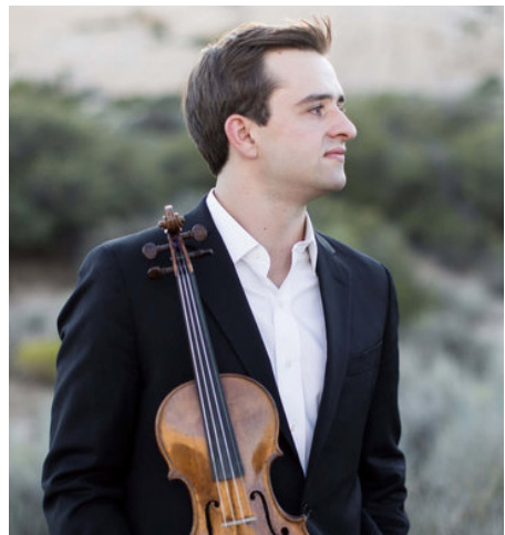
Programs and artists subject to change