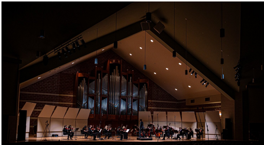
THE ILLINOIS PHILHARMONIC ORCHESTRA