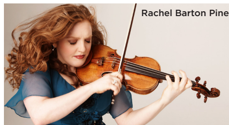
Rachel Barton Pine